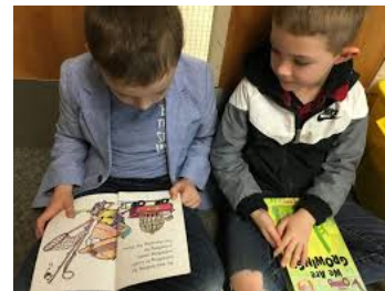
Learning to read together