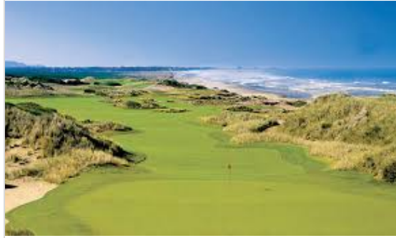
Links Golf at its Best