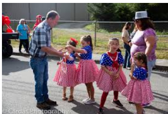
Getting Ready for the Parade