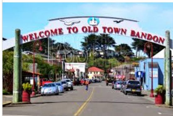
Old Town Bandon