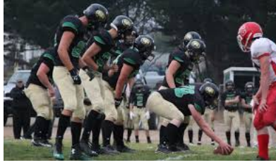
High School Football