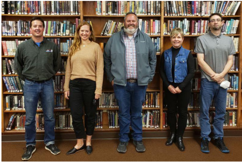
Central Curry School Board