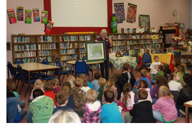
In the Library