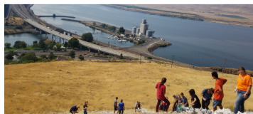
Re-Doing the "A" on the hillside