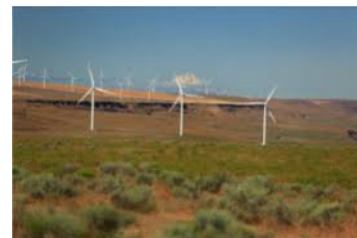
Wind farm towers everywhere