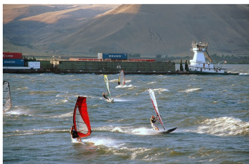
A windsurfer's paradise